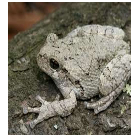
Gray Tree Frog

BREEDING/LAYING ANIMALS: Witness the breeding behaviors of Spotted Turtles , which lay their eggs in sunny locations during the spring months. They live in shallow water habitats including vernal pools, ponds and slow moving streams. They lay 4-5 eggs in sunny locations. Keep an eye for Lady Beetles mating and laying eggs, as well as Wild Turkeys nesting in depressions on the forest floor.